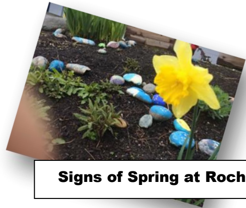
Signs of Spring at Rochester

On behalf of all students and staff, we want to show our thanks to our parent community by inviting you to a THANK YOU PARENTS breakfast on Thursday, June 8 th in our gym. There will be entertainment and the best breakfast this side of Austin!